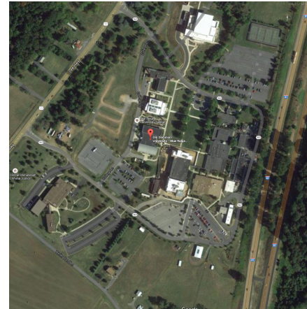
Google Maps Image

Property Size Acres 77.13 acres GPS Coordinates 38.278865, -78.939251 Number of sites in Parcel 1 Annual Energy Usage (Parcel) 5,445,100 kWh Utility Provider Dominion