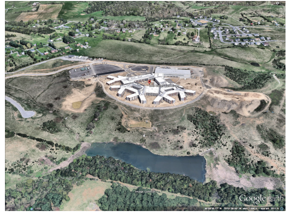
Google Earth 3D Image

Area for Potential PV Installation 8.7 acres