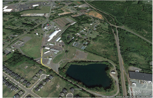
Google Earth 3D Image.

Property Size Acres 55.03 Acres GPS Coordinates 38.457354, -77.997244 Number of meters on site 3 Annual Energy Usage 1,493,941 Kwh Annual Demand Peak