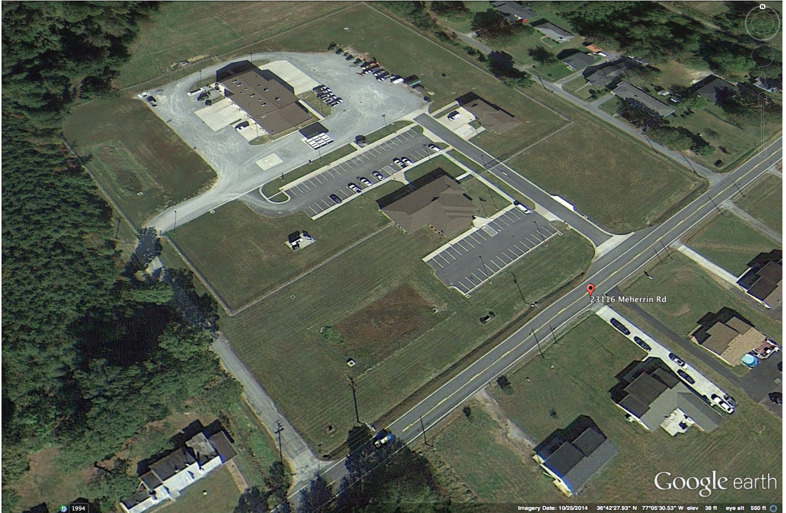
Google Earth 3D Image