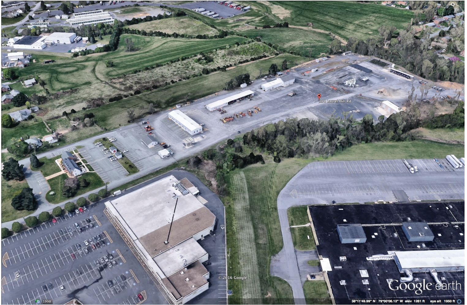
Google Earth 3D Image