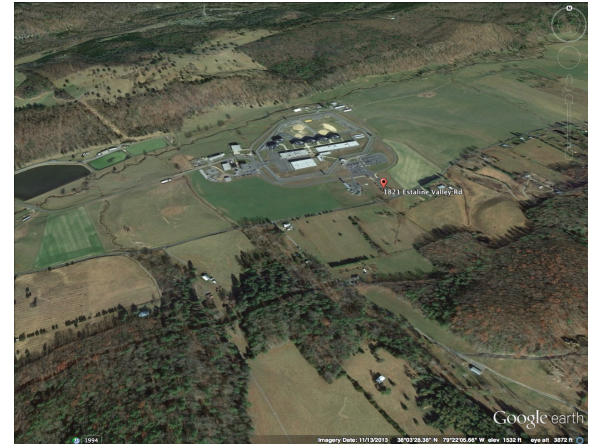
Google Earth 3D Image

Property Size Acres 394 acres GPS Coordinates 38.059603, -79.367524 Number of sites in Parcel 1 Annual Energy Usage (Parcel) Unknown at this time Utility Provider BARC