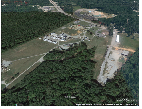
Google Earth 3D Image

Area for Potential PV Installation 9.38 acres