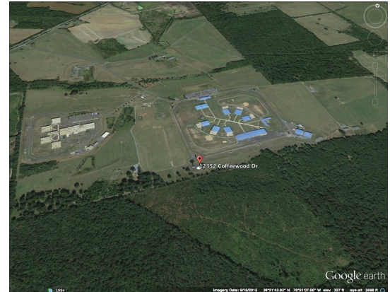
Google Earth 3D Image

Property Size Acres 606.6 acres GPS Coordinates 38.364869, -78.022403 Number of sites in Parcel 2 Annual Energy Usage (Parcel) Unknown at this time Utility Provider Rappahannock