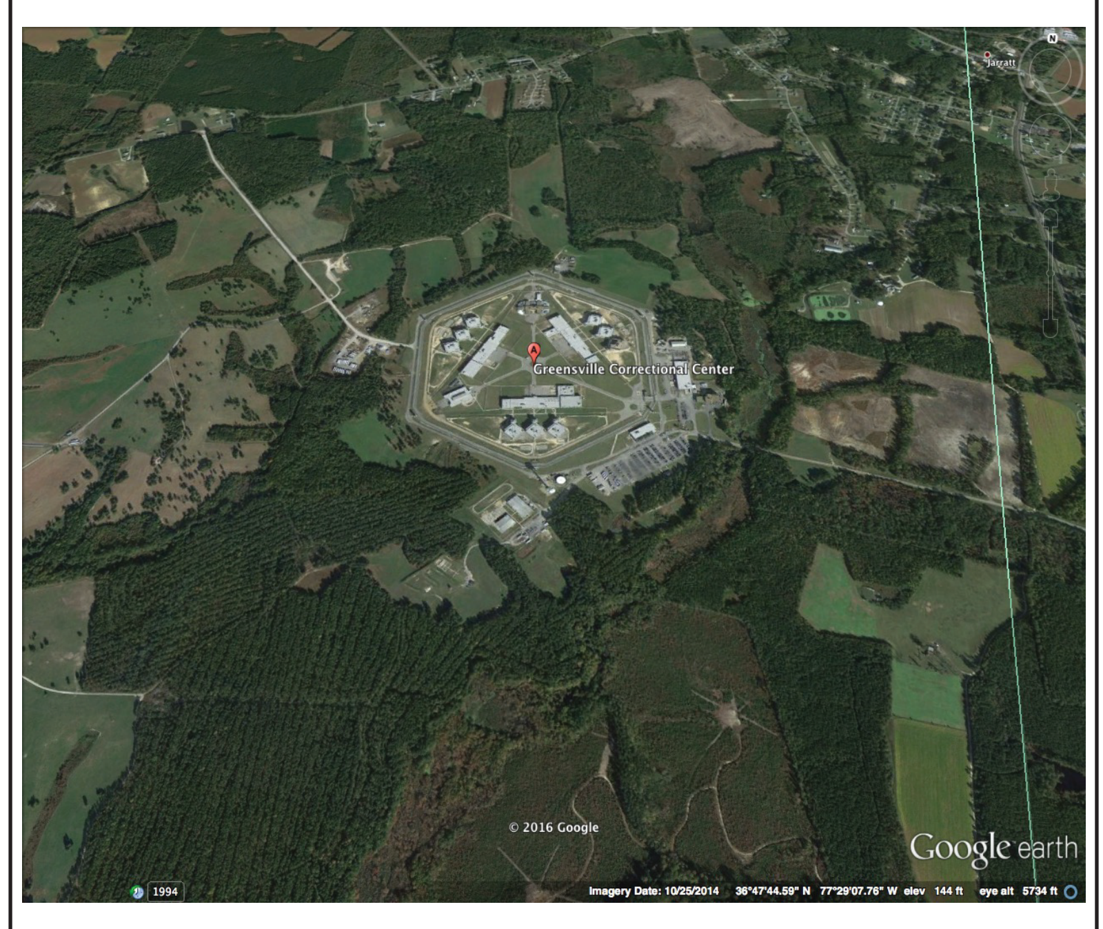
Google Earth 3D Image