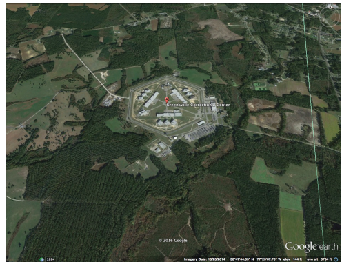
Google Earth 3D Image

Area for Potential PV Installation 205.8 acres