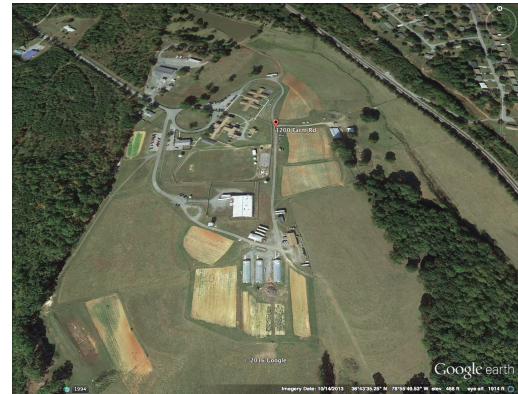
Google Earth 3D Image

Property Size Acres 122.44 acres GPS Coordinates 36.727567, -78.930319 Number of sites in Parcel 1 Annual Energy Usage (Parcel) 705,035 kWh Utility Provider Dominion