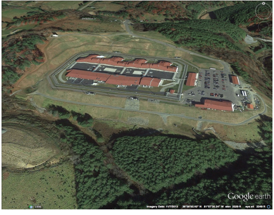
Google Earth 3D Image

Area for Potential PV Installation 0 acres