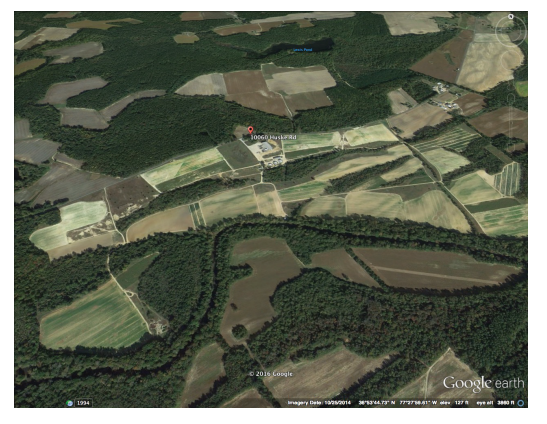
Google Earth 3D Image

Area for Potential PV Installation 111 acres