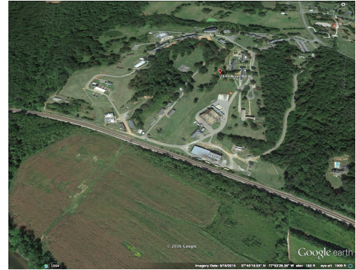
Google Earth 3D Image

Property Size Acres 258.25 acres GPS Coordinates 37.673929, -77.891218 Number of sites in Parcel 1 Annual Energy Usage (Parcel) 4,497,730 kWh Utility Provider Dominion